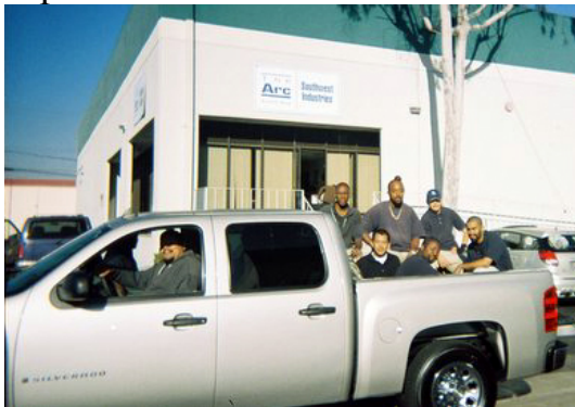
The lawn crew poses in the new truck!

In addition to individual placements, the department has two enclave programs, one for lawn service and one for janitorial. In these programs, small groups of consumers work together in the community under the supervision of trained staff.